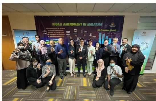
13 th March 2024