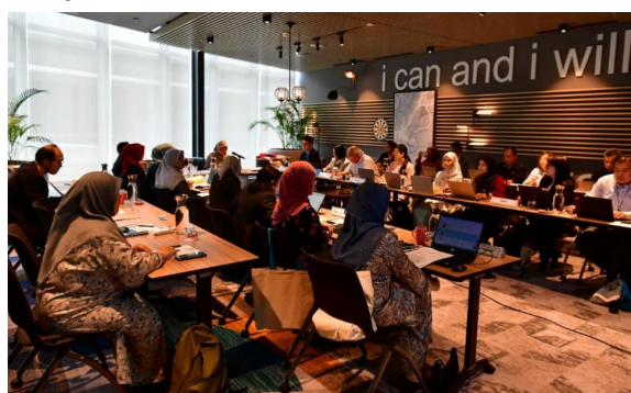
14 th August 2024