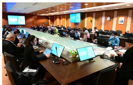
14 th March 2024